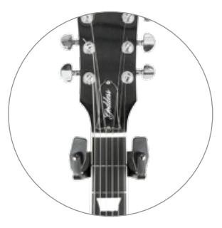
Automatically secures the guitar.