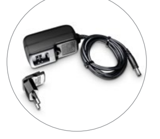
Power supply included.