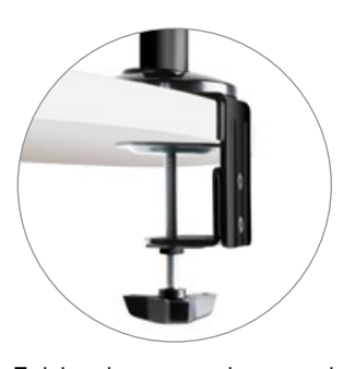
Table clamp and ground mounting included.