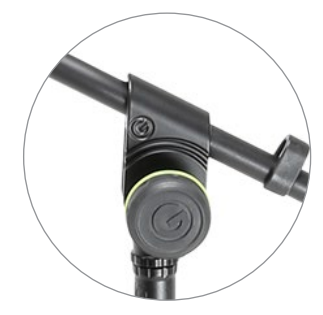
Convenient 1-point tilt and position adjustment of the boom arm.