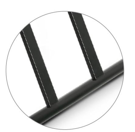
Reinforced tubes for superior strength and longevity.