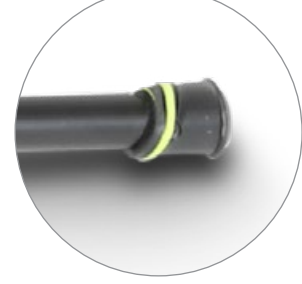
High quality rubber feet.