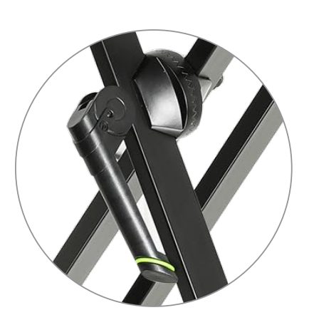
Ergonomic quick release clamp.