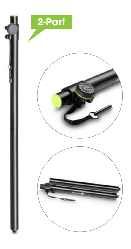
Adjustable Two Part Speaker Pole