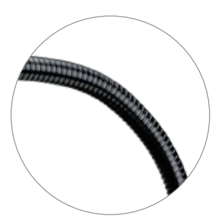
Gooseneck section for easy and flexible adjustment.