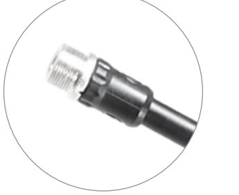
Specially tooled ergonomic retainer nut.