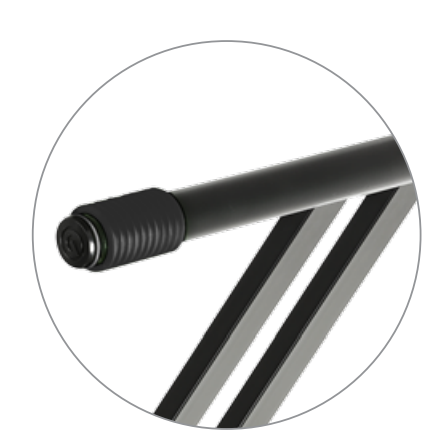
Black rests included.