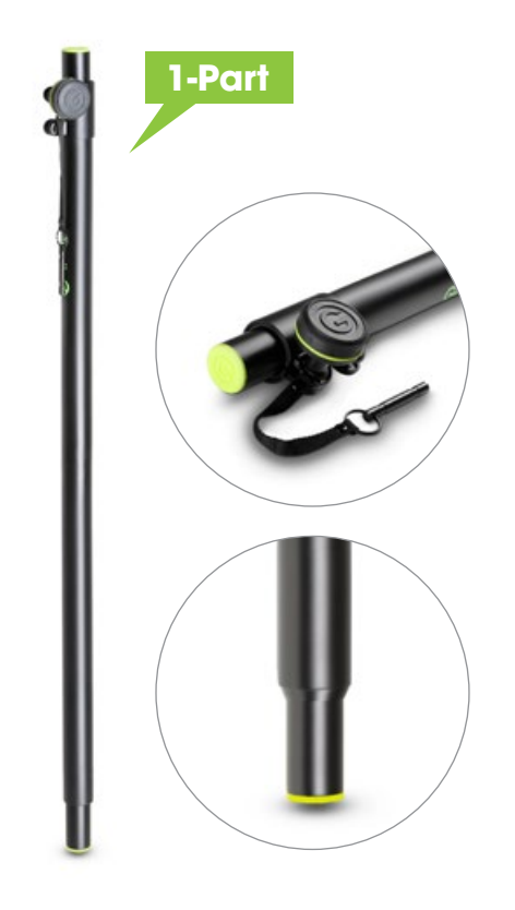
Adjustable Speaker Pole