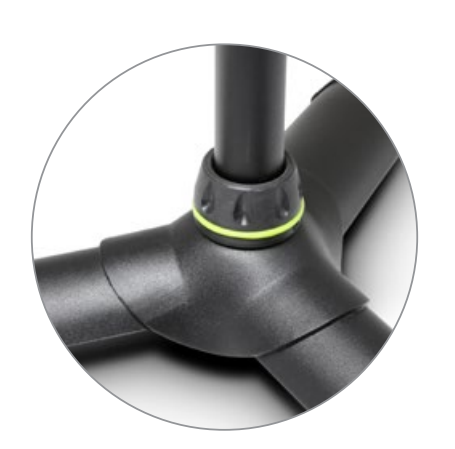
Stable steel base.