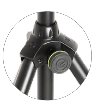
Newly designed aluminum die-cast base connector for superior strength.