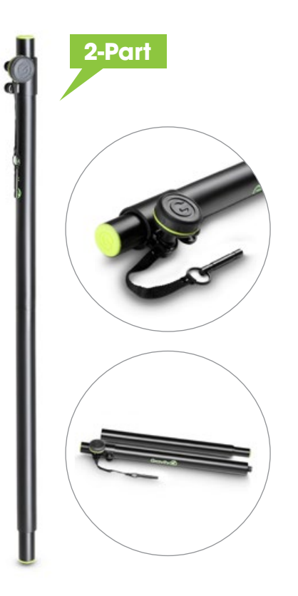
Adjustable Two Part Speaker Pole