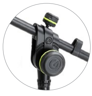
Super accurate and stable 2-point boom joint.