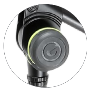
Comfortable ergonomic knobs with thermoplastic rubber coating.