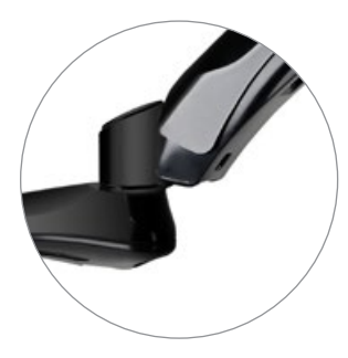
Integrated cable management.