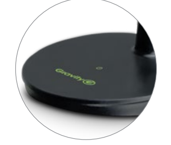
Touch power/dim switch. Touch the surface to power on/off. Press and hold to dim.