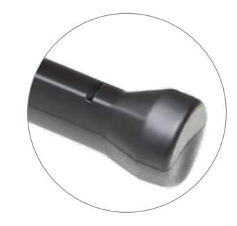
Non marring rubber coating.