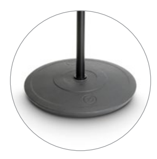
Circular base plate with rubber bottom for acoustic isolation and surface protection.