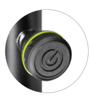
Comfortable ergonomic knobs.