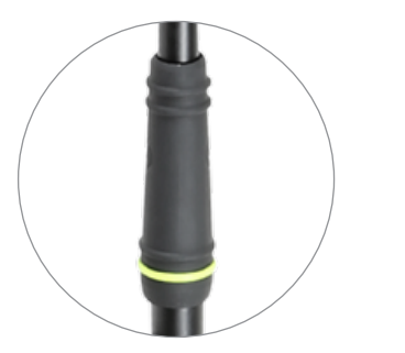
Nonslip soft touch rubber-coated clamp for height adjustment.