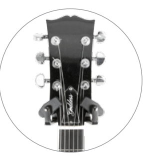
Innovative neckhug technology.