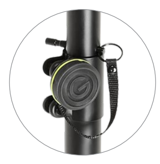
Sturdy, virtually indestructible steel collar with safety pin.