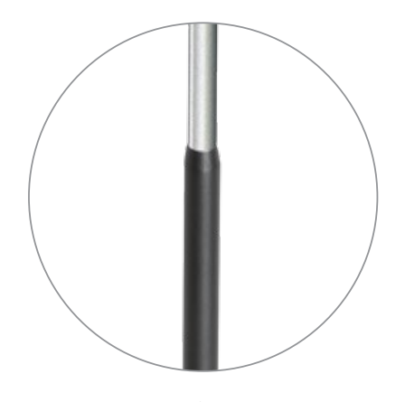
Foolproof operation, knob free tilt and height adjustment.