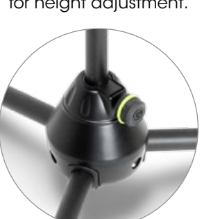
Ultra-sturdy die-cast zinc base.