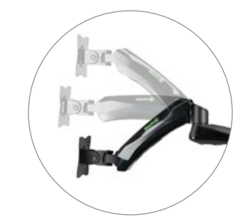
Gas spring and adjustable spring tension gauge.