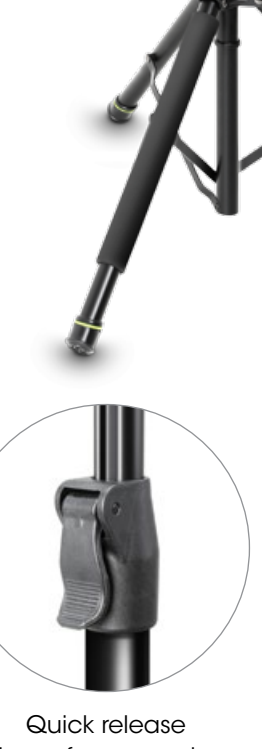
Quick release clamp for easy setup and adjustment.