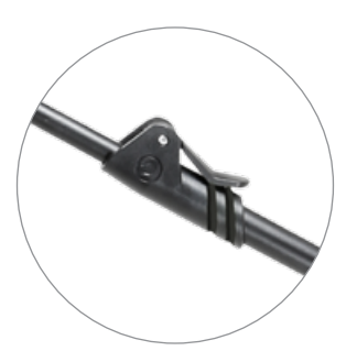
Telescopic boom with quick release clamp for easy adjustment.