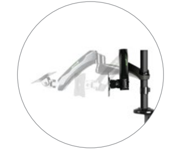
Swivel 180°, tilt -90° / +90°, rotate 360°, adjustable height.