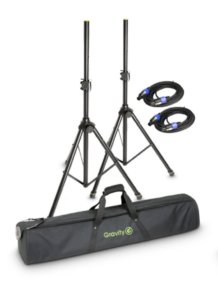
Set of 2 Speaker Stands with Bag and 2 x 5 m Standard Speaker Cables

Set of 2 Speaker Stands with Bag and 2 x 5 m XLR Cables