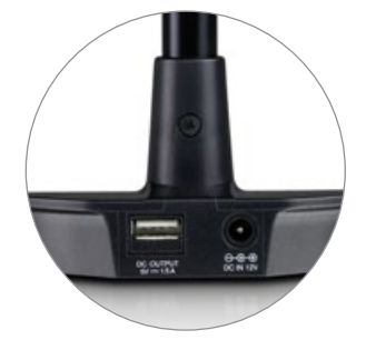
USB power out for charging 5 V DC, 1.5 A.